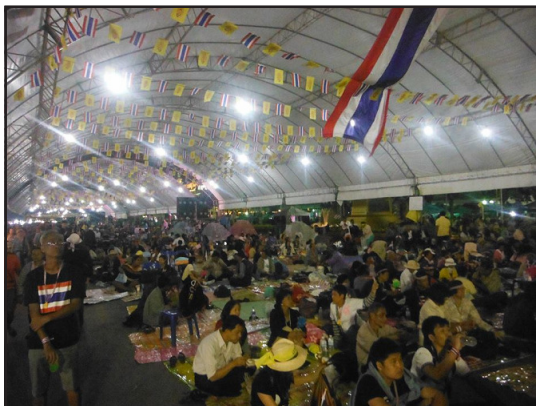
A camp has been set up nearby the Democracy Monument for the protesters to sleep over, cook and eat free food together while listening to speeches at night.

Facing strong public resistance, the Yingluck government eventually backed down and the Senate rejected the bill unanimously on 11 November. But under the leadership of the Democrat Party, the rival of Yingluck's Pheu Thai Party, the demonstration was soon elevated to an anti-government movement rally to topple the elected executive. The movement continues even after Yingluck's government dissolved the parliament and scheduled the new election for 2 February 2014.