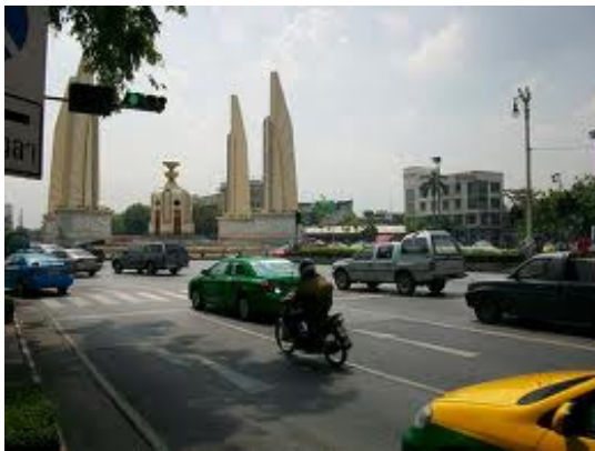
The Democracy Monument in Bangkok on a normal day

Each year, Bangkok is listed among the most-visited cities in the world. Thailand's capital, whose real name is 'Krung Thep' or the 'city of god', is known for beautiful temples, gorgeous palaces, naughty nightlife, great shopping malls, and tasty street food. Popular sites include the Grand Palace, the Temple of Emerald Buddha and Khaosan Road where thousands of young tourists check into affordable hotels everyday.