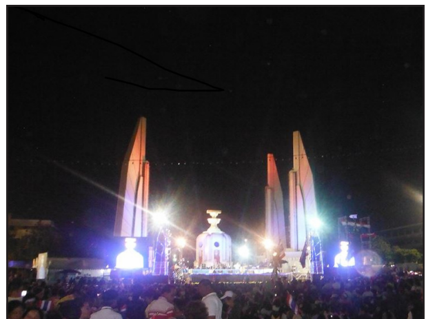
Anti-Yingluck government protesters gather around the Democracy Monument at night.

Not surprisingly, the bill was sponsored by Thaksin's sister, Yingluck Shinawatra, who is also the current Prime Minister and seen as his proxy. The bill had been passed earlier by the lower house, and if also cleared by the Senate, would have given a clean slate to Thaksin, who