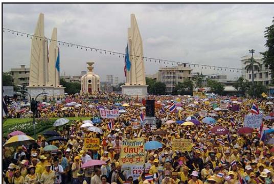
The Yellow Shirt's movement against People's Power Party converged in 2008.

Since the last years of Thaksin's premiership, which saw his popularity declining among the middle class due to alleged misuse of power and cronyism, Thai politics has often turned into a literal street battle. Mass protests have been used as a tactic by a variety of movements that have lost trust in elections and the parliamentary system. With strong support from the grassroots, Thaksin's party has resurrected and managed to win elections despite having been disbanded twice by the Constitutional Court.