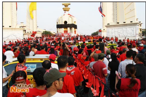
Red Shirt movement paying tribute to the protesters killed on 10 April 2010.

The “Black May” of 1992 put the Democracy Monument back into the center of Thailand's political scene. The site was then used as a rally point against the newly appointed Prime Minister, Army General Suchinda Kraprayoon, an ex-army chief who had earlier vowed not to assume the premier post as he was not elected to the Parliament. The 200,000 protesters suffered a bloody military crackdown, which lasted for three long days, from 17 to 20 May, before Suchinda finally agreed to step down and ended the crisis.