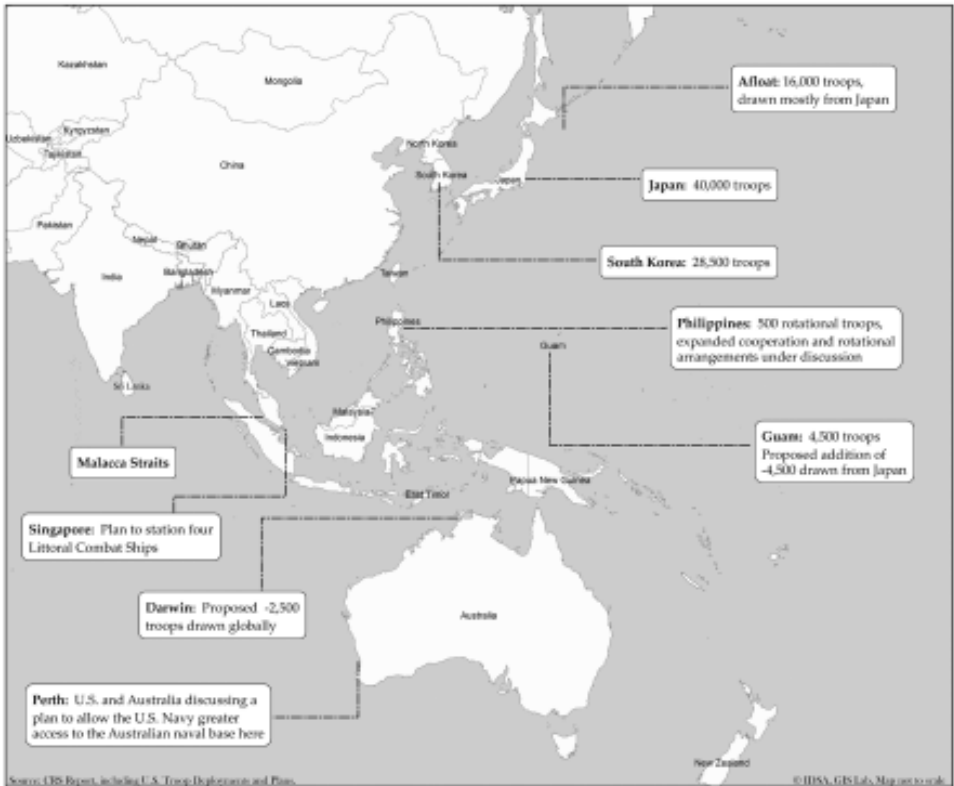
Figure 1: Map of the Asia-Pacific Region 54