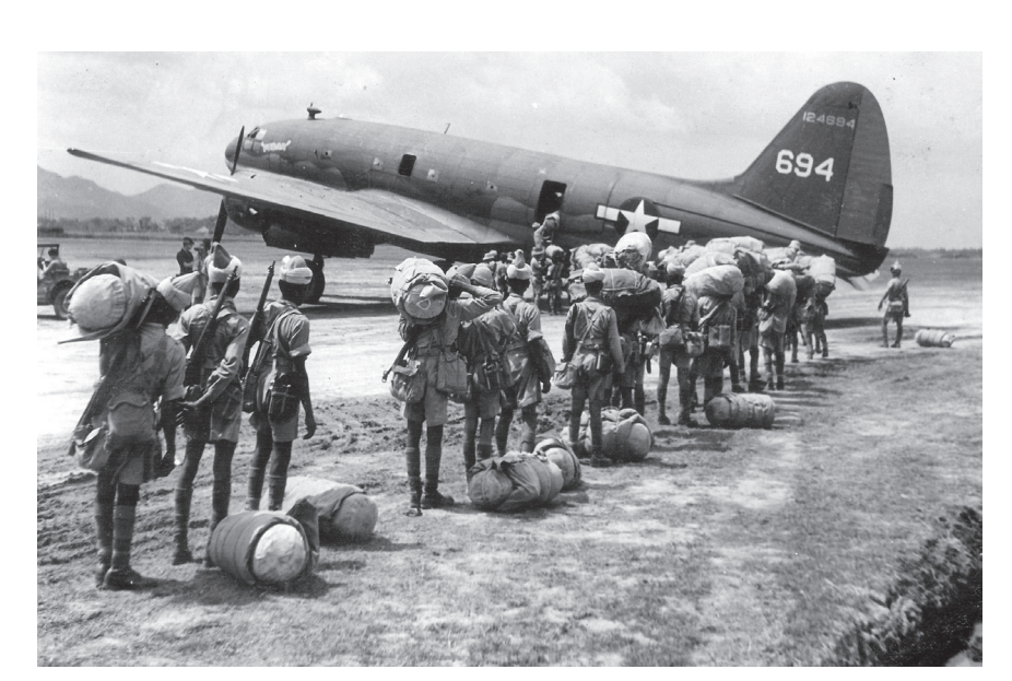
Figure 3 Troops of 5th Indian Division prepare to emplane for Imphal on the Burma front in a US Air Transport Command aircraft, March 1944