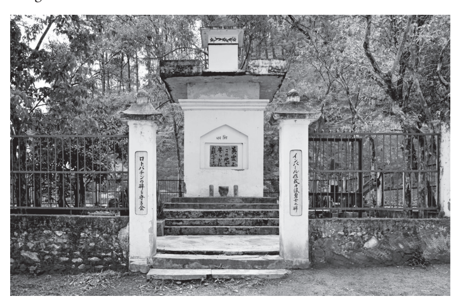
Figure 4 Japanese War Memorial, Red Hill/Maibam Lotpaching

1. India Peace Memorial, Maibam Lotpaching: The only Japanese war memorial in the country, this was constructed by the Japanese government on the site of the Battle of Red Hill at Maibam