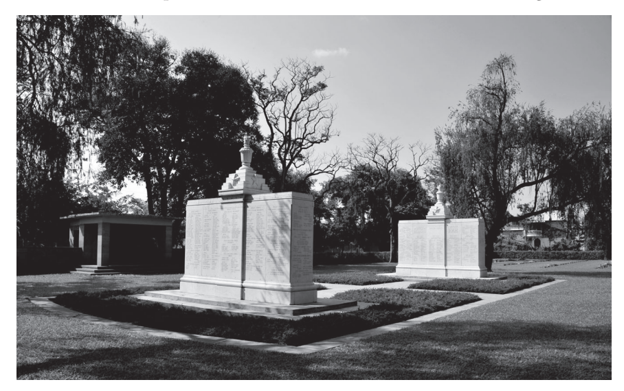
Figure 5 Imphal Indian Army War Cemetery

There are two Second World War cemeteries in Imphal. These are maintained by the Commonwealth War Graves Commission. The first one, the Imphal War Cemetery, contains some 1,600 graves of