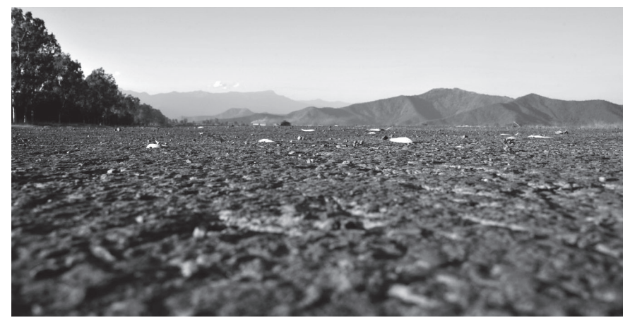
Figure 6 Imphal Main/Koirengei Airfield