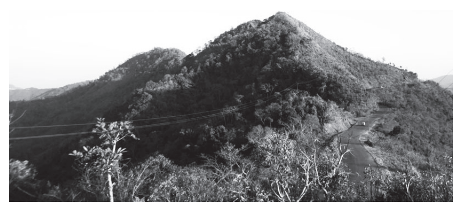
Figure 2 Shenam Saddle