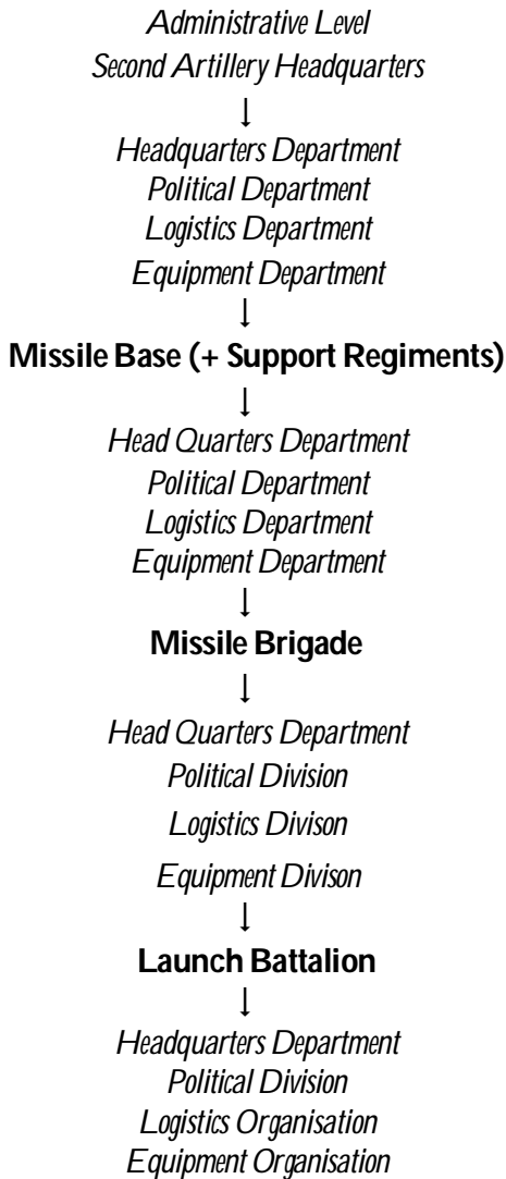
TABLE 1 PREVIOUS ADMINISTRATIVE LEVEL ORGANISATION