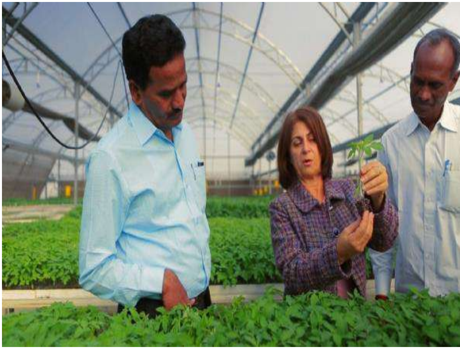
Representation pic