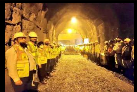
- India Infra Hub