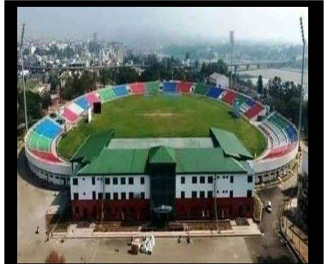
Maulana Azad Stadium at Jammu