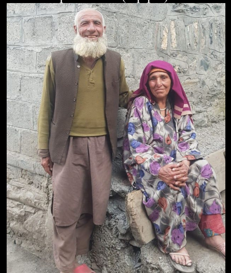
Elderly couple in traditional attire