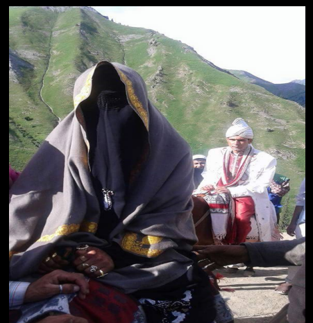
A masked bride on a pony , with her groom in tow, leading the marriage procession (top pic).