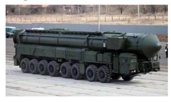
RS-24 Yars (SS-27 Mod 2) ICBM.

Emphasising its "defensive" nature, the policy states that nuclear weapons are a means to maintain credible deterrence against potential adversaries. According to the document, the key "dangers" that have the potential to translate into "threats", thus warranting "nuclear deterrence" are: military build-ups in Russia's immediate neighbourhood; deployment of missile defence systems, cruise and ballistic missiles, and nuclear weapons and delivery systems in non-nuclear states; and, high-precision non-nuclear and hypersonic weapons, unmanned combat aerial vehicles, and directed energy weapons.