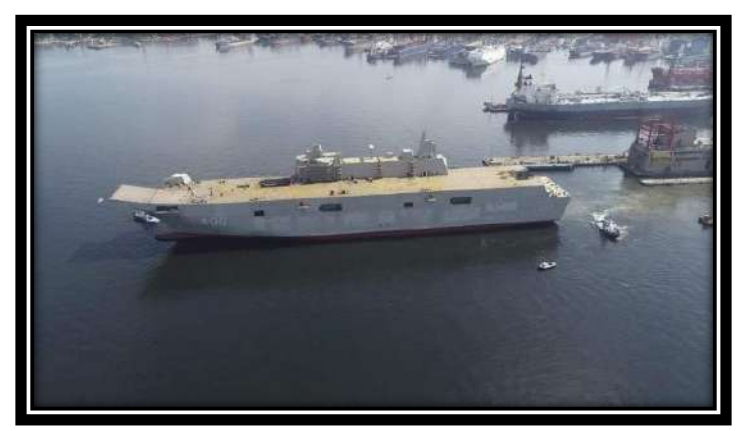
TCG Anadolu.

Turkey is driven by the ambition to play a greater regional and global role. This has been propelling it to develop its military capability including through the modernisation of its air and naval forces. The country's military expenditure witnessed a steep 86 per cent rise in the last decade. According to the Stockholm Peace Research Institute, Turkey is the 16th largest military spender in the world. In 2019, its defence expenditure totalled USD 20.4 billion, constituting 2.7 per cent of Gross Domestic Product and 7.8 per cent of government expenditure.