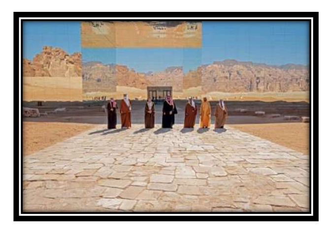
GCC leaders at At-Ula

unified economic and political group for achieving security, peace and stability in the region. Saudi Arabia and Qatar announced the opening of their air space, land and sea borders, which were closed in the wake of the announcement of boycott of Qatar in June 2017. All countries have also resumed full diplomatic relations. The United States and Kuwait played a key role in bringing the estranged members of the GCC together.