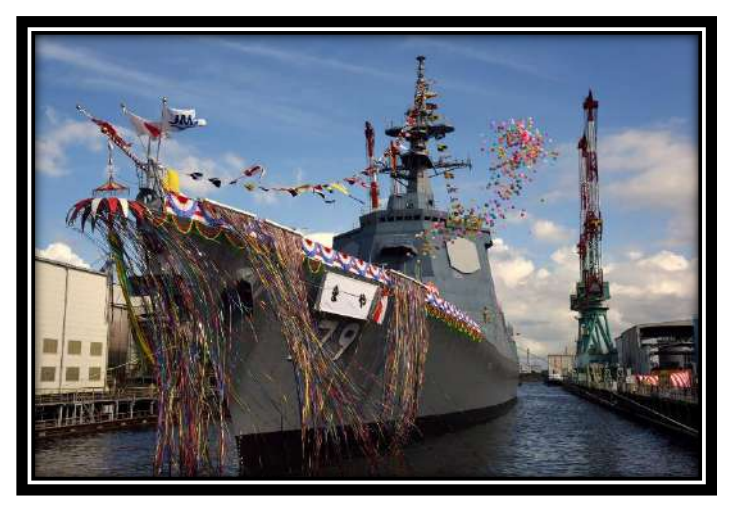
Maya class Aegis Destroyer

Japan cancelled the Aegis Ashore system in June 2020 due to increasing cost, technical challenges, stretched timelines and domestic politics. The country had opted for the Aegis Ashore in June 2017 in order to augment its ballistic missile defence capability.