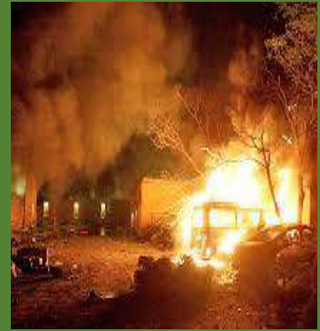
Cars set ablaze by the blast

The Tehreek-e- Taliban Pakistan (TTP) claimed responsibility for conducting a suicide blast at a luxury hotel, which hosted the Chinese Ambassador to Pakistan, even though the diplomat was not present in the hotel at that time of the explosion. Five people are reported to have lost their lives, while 11 were injured in the attack.