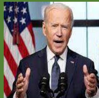
US President Biden making the announcement on 14 April 2021

The US will withdraw all remaining troops from Afghanistan by the 20 th anniversary of the September 11 attacks, President Biden announced on 14 April, 2021. These words, spoken from the Treaty Room of the White House, turned the page on a war that has cost the US trillions of dollars and the lives of 2,300 of its troops.