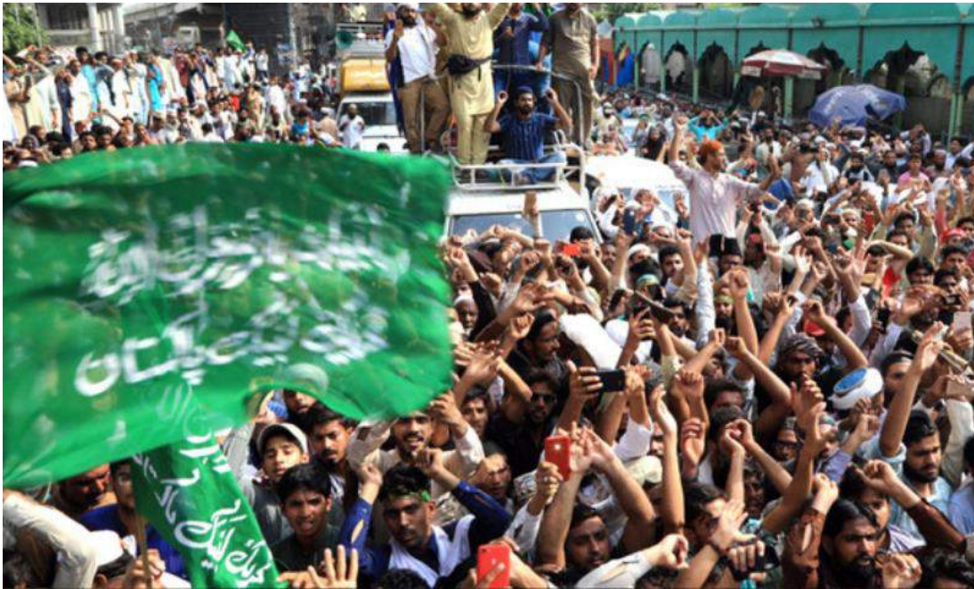
Tehreek-e-Labbaik members protesting for the expulsion of French Ambassador to Pakistan

NATIONAL ASSEMBLY TO DISCUSS EXPULSION OF FRENCH AMBASSADOR