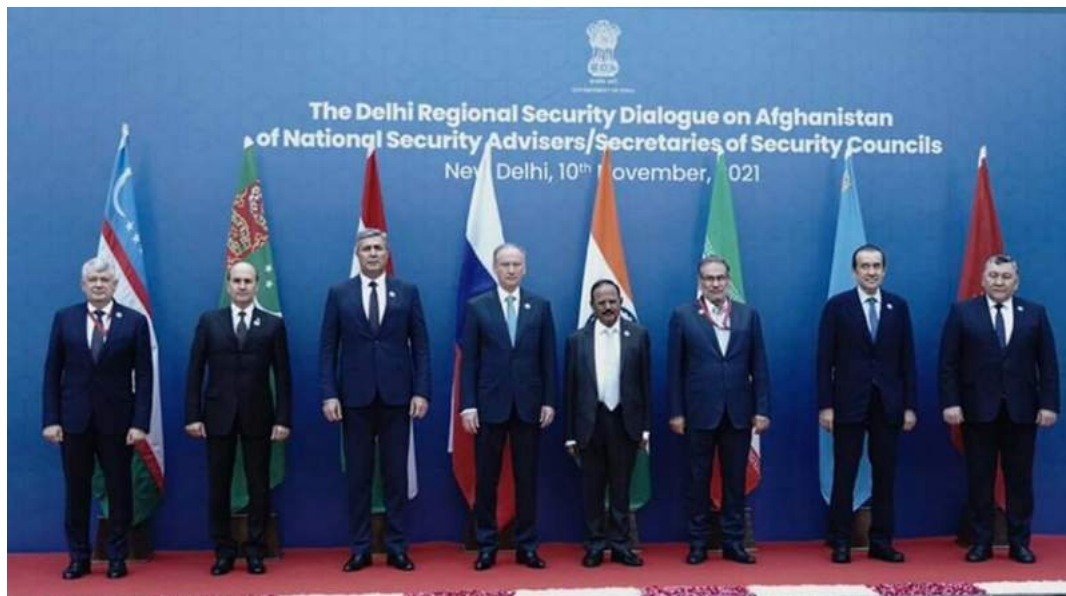
NSA Ajit Doval with National Security Advisers/Secretaries of Security Councils of Iran, Kazakhstan, Kyrgyzstan, Russia, Tajikistan, Turkmenistan, Uzbekistan during The Delhi Regional Security Dialogue on Afghanistan on 10 November 2021.

RISK OF TERRORISM, DRUG TRAFFICKING UNDER TALIBAN RULE DISCUSSED