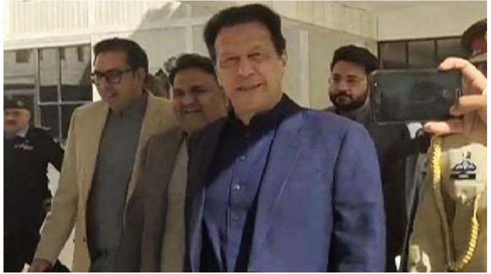
Pakistan PM Imran Khan arriving at his country's Supreme Court to explain his decision to negotiate with the terrorist group TTP.

APEX COURT GRILLS IMRAN ON TALKS WITH TTP, SINDH ASSEMBLY SLAMS PM