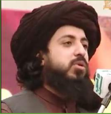
Tehreek-e-Labbaik Pakistan (TLP) Leader Hafiz Saad Hasan Rizvi

On 7 November 2021, Pakistan prime minister approved the removal of the radical Sunni Barelvi group, Tehreek-i-Labbaik Pakistan (TLP) from the country's list of banned outfits.