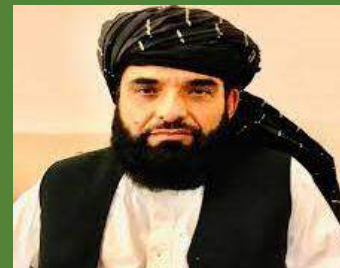
Taliban spokesperson Suhail Shaheen

Following the conclusion of the NSA-level Afghan meeting, Taliban spokesman Suhail Shaheen called the event a positive development and hoped its deliberations would “contribute to the peace and stability of Afghanistan”.