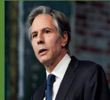
US Secretary of State Anthony Blinken

The US Secretary of State, Antony Blinken, tweeted to commemorate the 13 th anniversary of the deadly terrorist attacks in 2008.