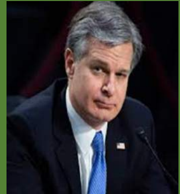
FBI Director Christopher Wray

On 2 March 2021, the director of the US Federal Bureau of Investigation told a Senate panel that the Jan. 6 riot at the US Capitol building aimed at preventing the certification of Joe Biden's presidential victory over Donald Trump was domestic terrorism.