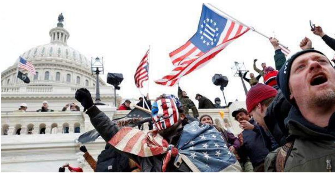
Pro-Trump rioters at Capitol Hill on 6 January 2021

FBI Follows Trails on Social Media, 300 of the 800 Rioters Arrested, Many at Large