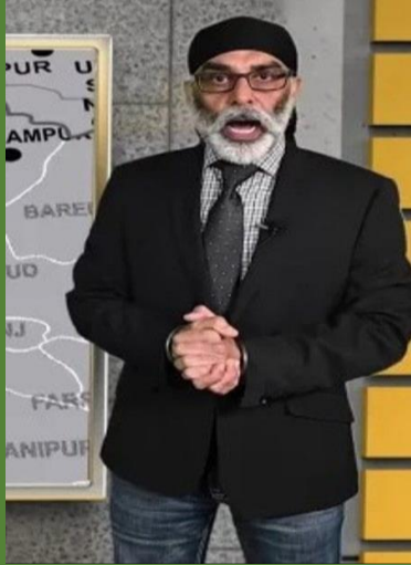
GURUPATWANT SINGH PANNUN

Gurupatwant Singh Pannun's (Chief of the proscribed organisation Sikhs for Justice, SFJ) properties have been seized by the NIA in Amritsar and Chandigarh. Pannun was designated as a terrorist by India's Ministry of Home Affairs in July 2020.