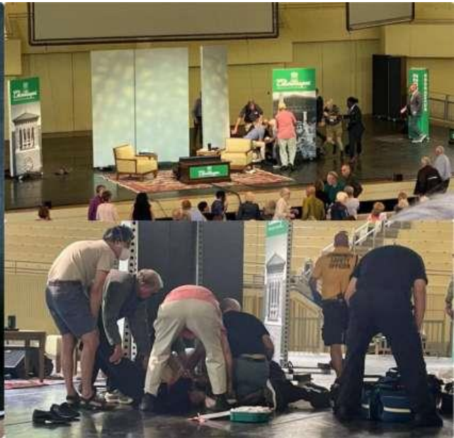
Rescuers come to the aid of Salman Rushdie after he was stabbed at a literary event in New York

In a court appearance on 18 August 2022, a judge ordered Hadi Matar, the 24-year-old accused of stabbing Salman Rushdie, to be held without bail at Chautauqua County Jail, in New York state.